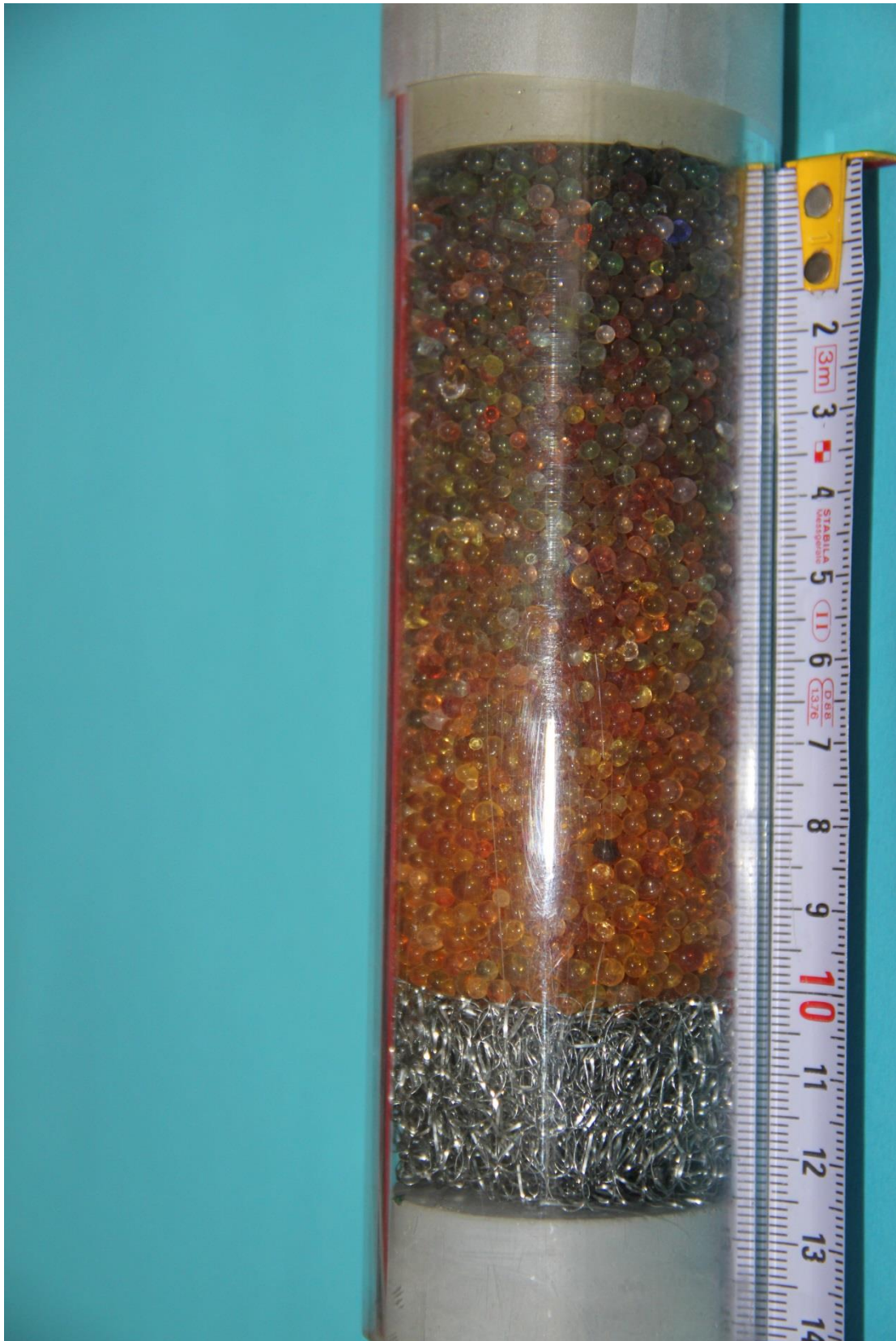
Fig. 2, Test arrangement