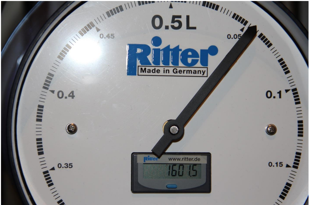
Fig. 4, Drum gas meter